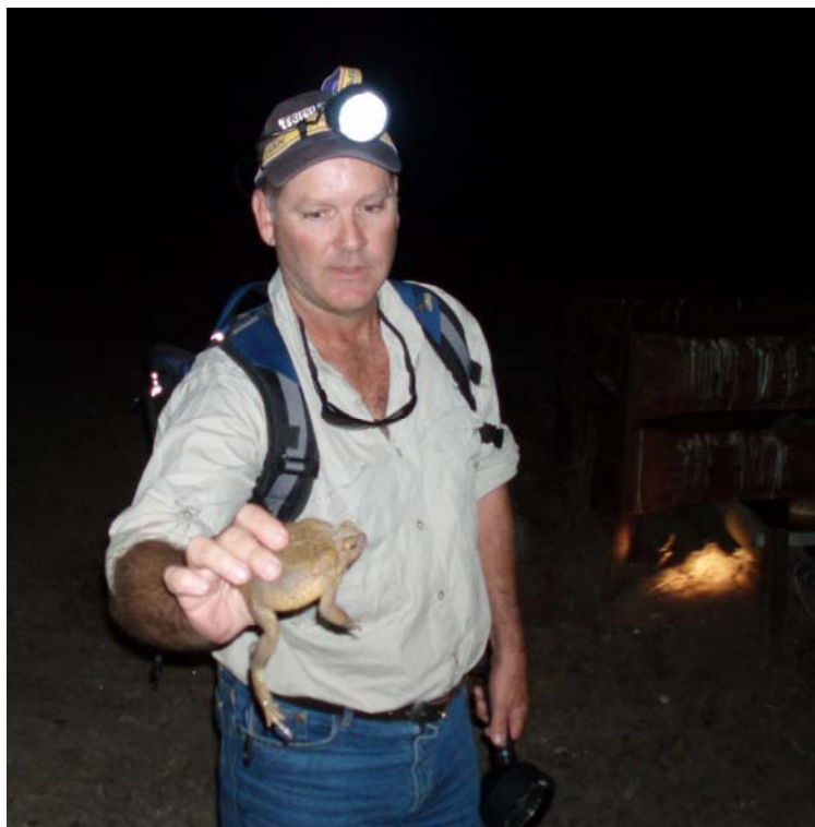
An example of catching cane toads in the field, note the long sleeves, and pants, head torch, spot light, backpack/water carrier and captured toad. Note the toad has 'blown up' it's body to make itself look larger.